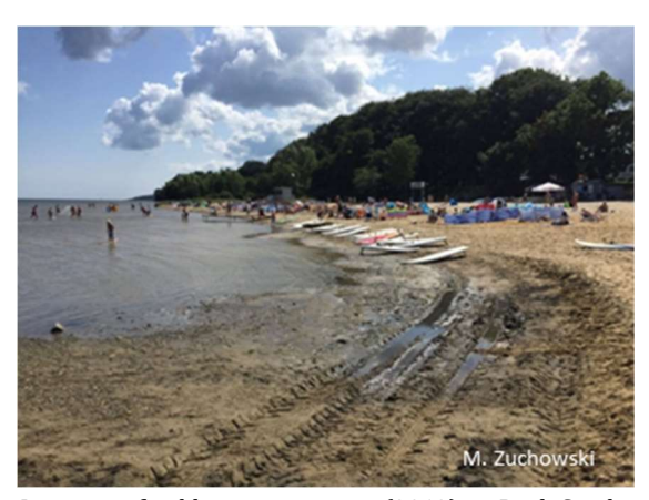
Location of public questionnaire (2019) on Puck City beach, Poland

including adjacent restaurants, rentals, sports equipment. The accumulation of marine waste generates a bad smell and this also negatively affects the number of people using beach related services.