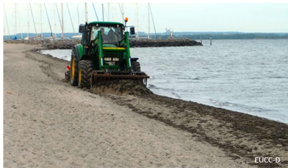
Beach wrack landing (left) and beach wrack removal operations (right) on Timmendorfer Strand, Island of Poel (DE)

Tourism plays an essential role on the Island of Poel and is the most important employer. Two main tourist beaches on Poel are Timmendorf Strand and Schwarzer Busch. Both are sandy and popular with tourists in the summer months. Both these main tourist beaches (approximately 3km out of a total 9km beach length on the island) are mechanically cleaned daily during the tourist season. With respect to the size of beach wrack landings on the main tourist beaches, the local Spa Manager regards a small monthly amount of beach wrack as being 100 tonnes per month, medium amount is 300 tonnes, large amount is 500 tonnes and an extreme event, could see amounts of 700 tonnes landing per month. In general, the local authority reports that beach wrack amounts have been increasing over the past 10 years. The municipality cooperates with a local fertilizer company Hanseatische Umwelt GmbH which is paid to periodically come and collect stored beach wrack (CONTRA, Management Questionnaire, 2019).