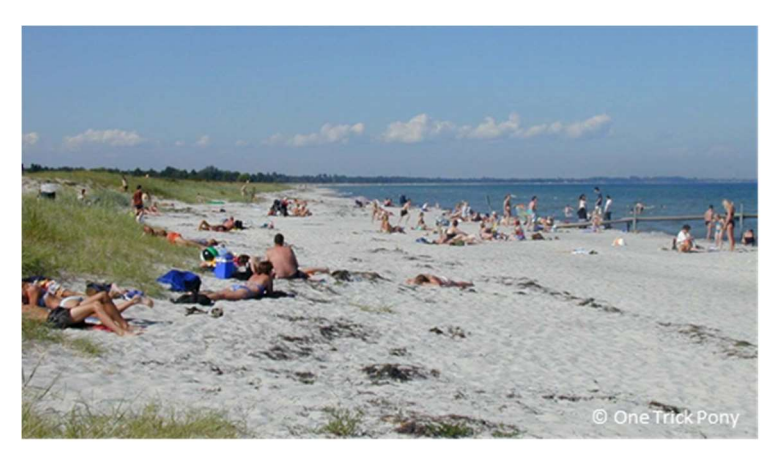
Patchy beach wrack on tourist beach in Municipality of Køge Denmark (DK)

on when during the year levels are high. Like for most other coastal municipalities there is a lack of local data to support the decision making process. The municipality also reports a lack of knowledge and clarity on the legal framework surrounding beach wrack management, particularly governing collection and storage. Information gathered from other DK municipalities has led to an understanding that actually, a permit (according to the environmental protection law paragraph 19) is required when storing it in piles. However, the lack of legal understanding means that many municipalities like Køge still go ahead and pile it up to decompose out of the main tourist beach area. Questions on local regulations need to be discussed with the Environmental Protection Agency.