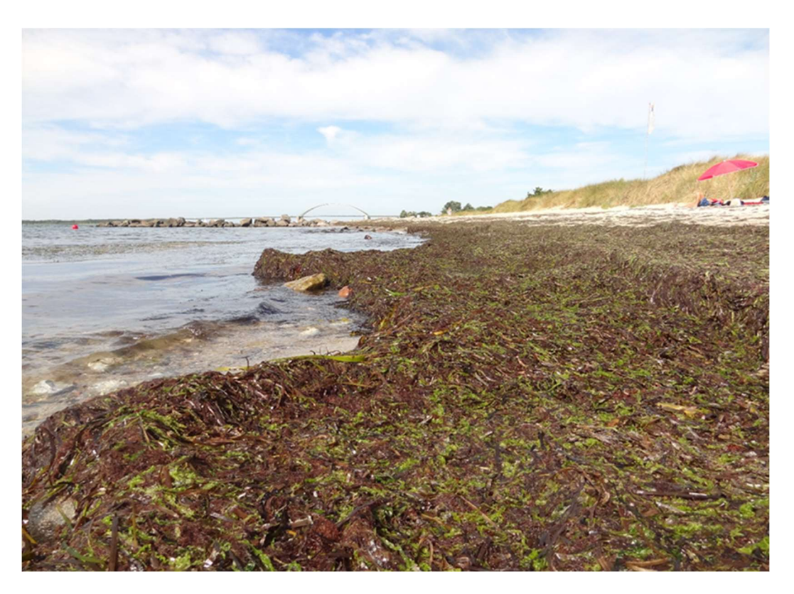
Large beach wrack quantities on Island of Fehmarn (DE)

the outset that socioeconomic and environmental factors are in conflict at every case site, but it seems that pathways to resolve these conflicts are not being considered. The sheer complexity of the factors at play makes balancing stakeholder interests very difficult even in the short- and midterm. This report is an important first step in establishing and increasing awareness of stakeholder opinions on the topic of beach wrack, however further research is required to develop any guidelines on a local level that beach managers can refer to while considering all relevant specificities of their beaches.