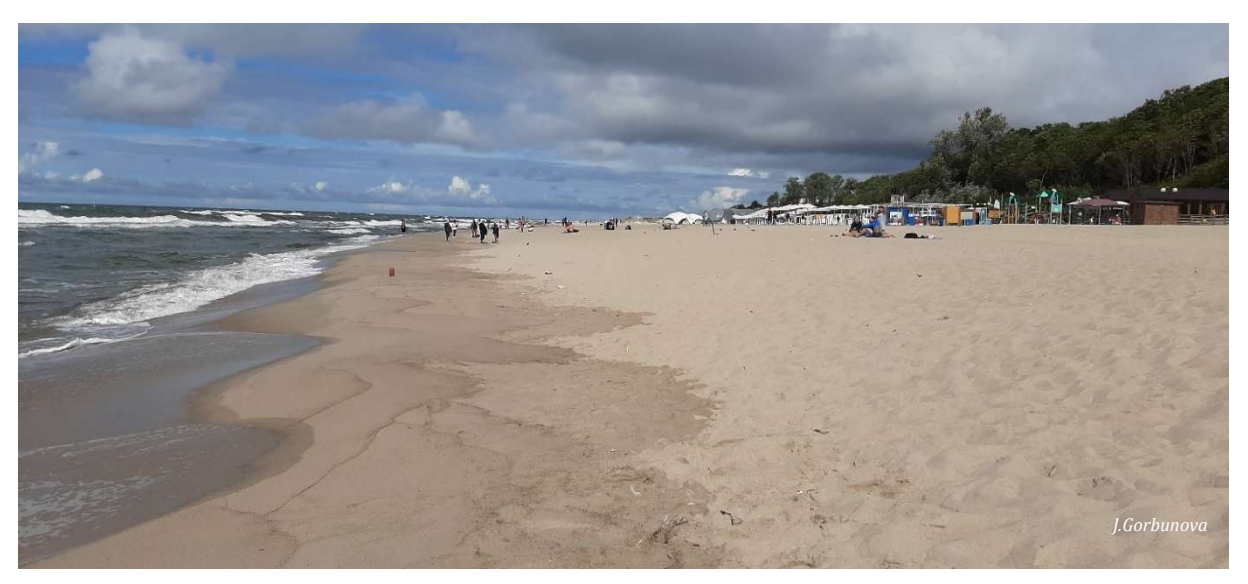
Yantarny beach, Kaliningrad (RU)

The development strategy of the Yantarny urban district defines tourism as one of the leading industries. This is associated with the development of another leading industry, namely amber trading.