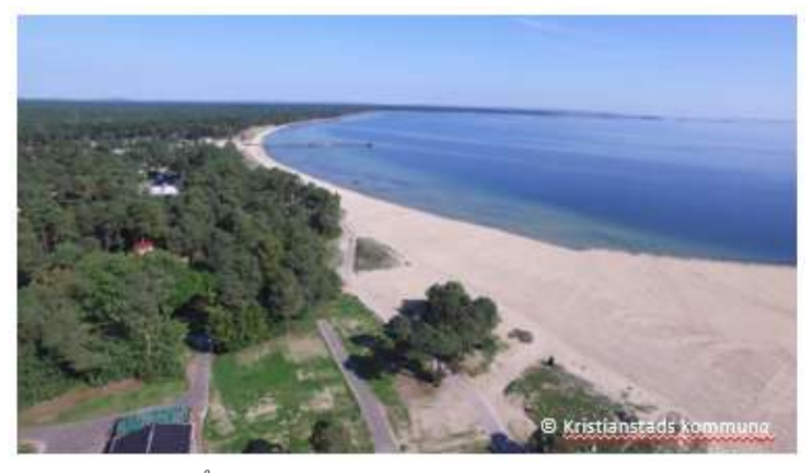
Täppetstranden, Åhus, Kristianstad, Sweden

The beach Täppetstranden is situated in the medieval town of Åhus, a small village within the municipality of Kristianstad in Skåne, southeast Sweden. Åhus is one of the best preserved medieval towns in all of Sweden. Today Åhus is an "absolute" dream setting for around 12,000 permanent residents and at least as many summer visitors. The main attractions are the long sandy beaches, the excellent visitors' marina and the medieval town centre. Täppetstranden is also famous for hosting large beach soccer and beach handball sporting events. Täppetstranden is purposefully maintained with recreation in mind. It has the Blue Flag award and has a high value for the municipality. The total tourist economical revenue for the municipality is around 900 million Swedish Kronor, based on 2 million visitors every year. The municipality estimates that the beaches in Åhus stand for at least 20 % of that. But they also say that it is just an estimation.