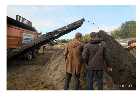
Beach wrack storage facility (left) and beach wrack treatment operations (right) Island of Poel (DE)

Like for many other coastal communities, it is economics that has the main consideration where beach wrack management is concerned on the Island of Poel. Since it is classified as waste, beach wrack at the moment has no economic value at the point of beach collection. The value of beach wrack removal lies in the provision of ,cleaned' recreational beach space and the tourist activities on the Island that depend on it being attractive for visitors. However, the relationship that the municipality has built up with the local fertilizer company does bring some added value to beach wrack removal. Even though the community pays extra to be rid of the material, it does so in the knowledge that it will be treated and used in a worthwhile and environmentally friendly manner.