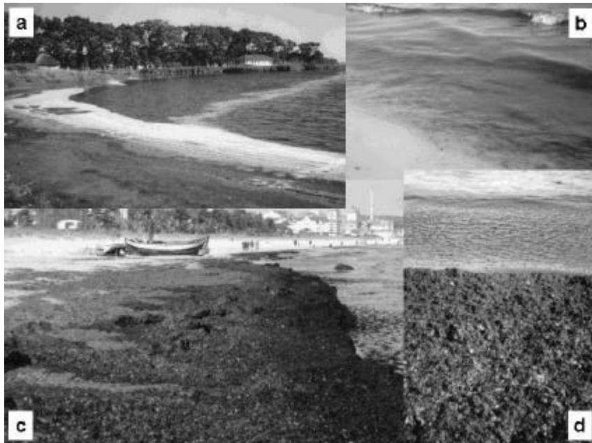
Picture 1: Problems along the eastern German Baltic Sea coast. a) Blue-green algae bloom ( Mycoysis ) at the coast of the Island of Rügen in Sept. 1999 (Greifswalder Bodden). b) Water turbidity due to makroalgae in Ahlbeck (Usedom) in Aug. 2000. c,d) Makroalgae accumulation including small amounts of seaweed near Binz (Rügen) in spring 2000.

Around the Oder Lagoon insufficient water quality is a problem for further touristic development. With respect to the EC bathing water directive, the water quality along the beaches towards the Baltic Sea can be regarded as good or very good. Depending on the wind conditions, the Oder river plume can significantly reduce water transparency on Baltic Sea beaches of Usedom and algae blooms as well as intensive makroalgae growth and accumulations along the beach are a common phenomena in these coastal water, too (Picture 1). It is very likely that eutrophication by the Oder river at least contributes to these problems. The competition for tourists became harder during the last years and environmental quality, especially high water quality, is an increasing ecological and economic factor for the spas along the Baltic Sea. Against this background the differences between the two 50 % reduction scenarios gain importance and the cost-effective scenario is favorable with respect to tourist industry.