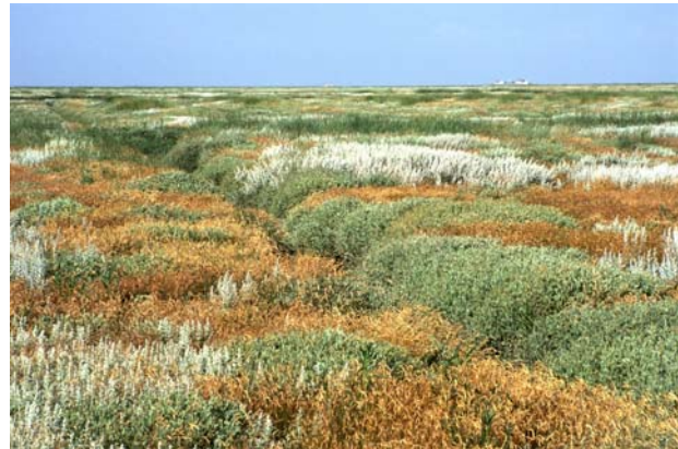
Figure 4: Ungrazed salt marsh of the Hamburger Hallig in 2002 (Photo: M. Stock).