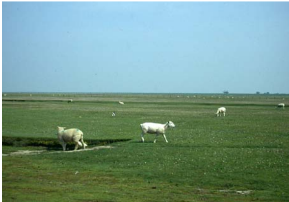
Figure 3: Intensively grazed salt marsh in the beginning of the 1990ies.

In summary, our results indicate that species density might decrease in the future in ungrazed plots on well aerated soils of the high salt marsh dominated by Elymus spp. In the low salt marsh and in less drained parts of the high salt marsh, soil water-logging and low sedimentation rates (Schröder et al. 2002, Kiehl et al. 2003) may impede species dominance and consequentially prevent a decrease in species density.